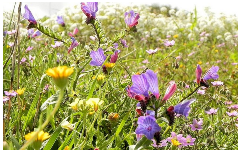
Now this is more like it!

And all of this on top of the coldest February in recorded Boston history as well. Although the decision on whether or not to close the centers is often difficult to make, the severe conditions actually made it rather easy for most of those days this winter.