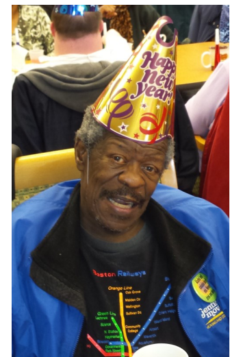
Top left: Santa visits the Everett center; Top right: Valentine’s Day King and Queen winners in Lowell; Bottom Row, Left to Right: looking cool for St. Patrick’s Day in Medford; men at the Medford center enjoy a Thanksgiving meal and; celebrating New Year’s in Everett.