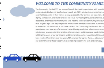
A sneak preview of our new website

video prominently displayed on the home page.