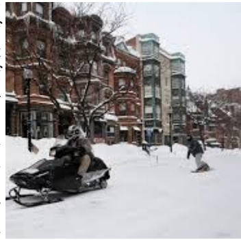
A winter scene from Boston's Newbury Street in February.

Congratulations on having survived the Winter of 2015. And what a winter it was! A record snowfall of well over 100 inches – nearly all of it over a four-week period beginning in late January – impacted The Community Family, as it did so many other businesses, homes and lives. As a result of several massive blizzards, our Everett and Medford centers were closed for six days of business and the Lowell center for five days.