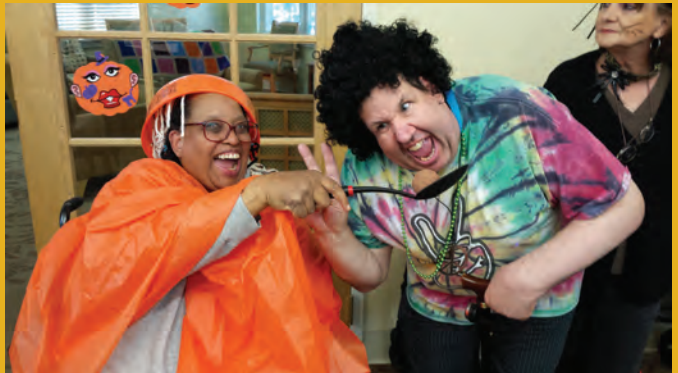
Client shown above left, dressed as "spaghetti and meatballs", voted Best Costume at the Everett center's 2016 Halloween party.

The Community Family is dedicated to providing high-quality adult day health services that keep adults in their homes as long as possible. Our services are based on a deep respect for the dignity, self-esteem and vitality of all those we serve. We are committed to improving the quality of life for both our participants and their families.