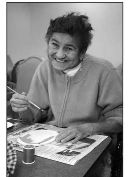
A happy Lowell participant