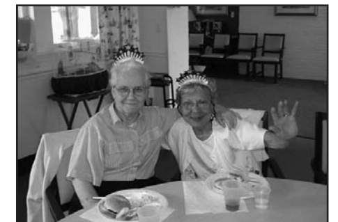
Annual Medford Cook-Out June 23, 2006

The Annual Medford Cook-Out , held on June 23rd, was enjoyed by more than 100 participants and their families. The Medford staff does a fabulous job preparing and serving a delicious barbeque. This special event provides families a comfortable and supportive setting for socializing with their loved ones.