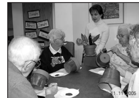
Lowell participants in the arts and crafts room