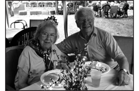
Annual Medford Cook-Out June 23, 2006