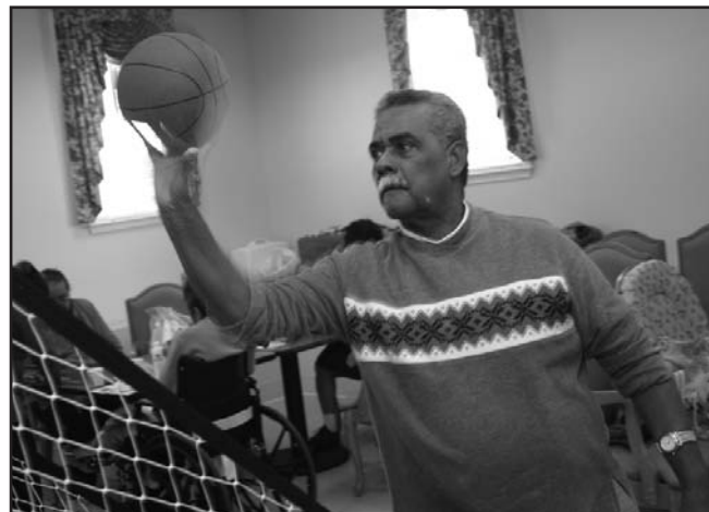
Enjoying Basketball at the New Traditional Program in Lowell

With the philanthropic spirit of these donors, The Community Family continues to provide high quality care to elders, disabled adults and their families.